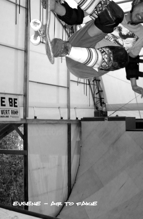
EUGENE - AIR TO FAKIE